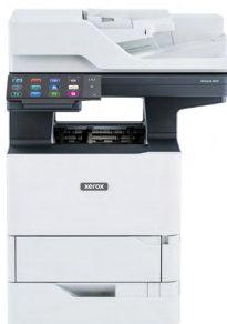
Xerox® VersaLink® B625 Multifunction Printer