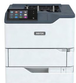
Xerox® VersaLink® B620 Printer