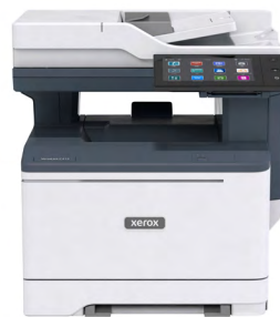
Xerox® VersaLink® C415 Color Multifunction Printer