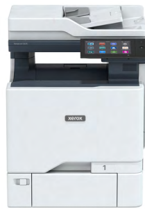
Xerox® VersaLink® C625 Color Multifunction Printer