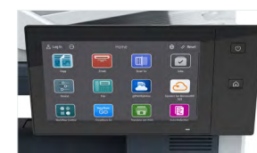
7-inch color touch screen