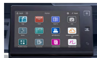
10.1-inch color touch screen

Experience the User Interface at www.xerox.com/SIM7 .