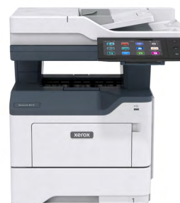
Xerox® VersaLink® B415 Multifunction Printer