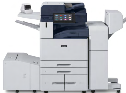
Xerox® AltaLink® B8245/B8255/B8270 Multifunction Printer