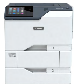
Xerox® VersaLink® C620 Color Printer